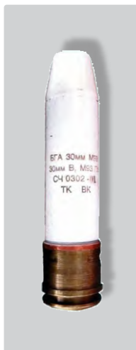
TP M93 P1